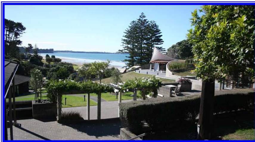
Vaughan Park Retreat Centre, Long Bay

A powerful workout in mindfulness practice & generative conversation for leadership